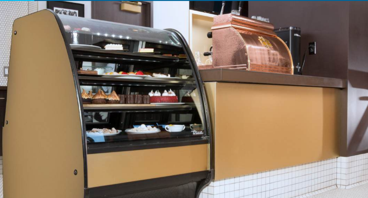
FIXED GLASS FRONT