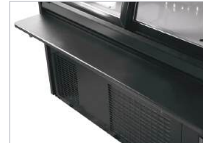
Front Merch Shelf