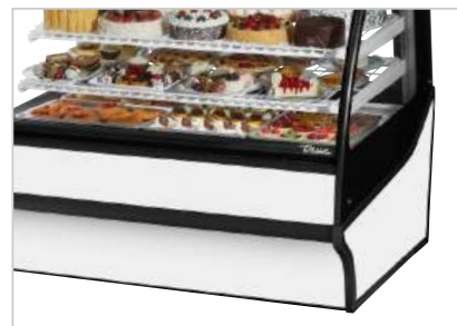
Clear Glass Interior / Clear Glass Exterior with Black Trim (GE) TDM