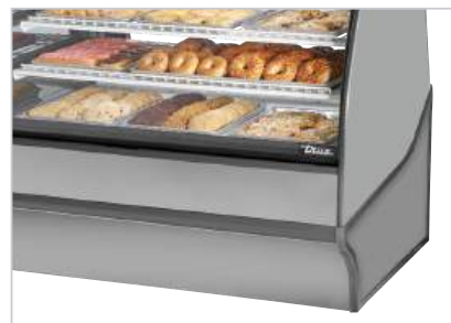
Mirrored Glass Interior / Solid Metal Exterior (SM) - Indicated finish B, W, S TGM | TDM