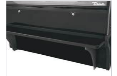
Rear Service Shelf