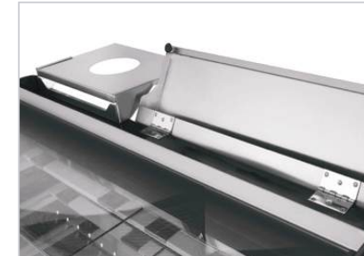
Top Service Shelf Available in various sizes.