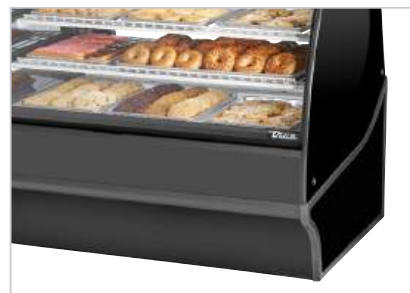
Mirrored Glass Interior / Black Glass Exterior (ME) TDM